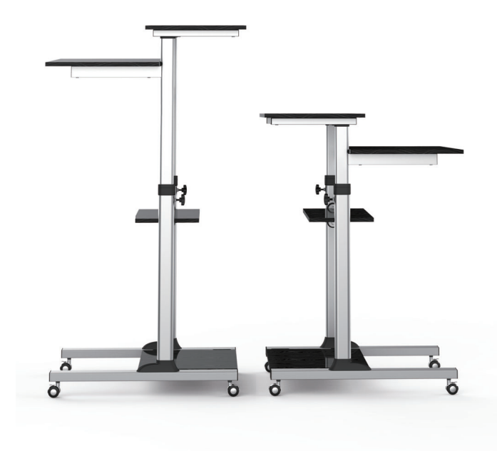
Effortlessly to healthy sit-stand heights so you can work with more comfort