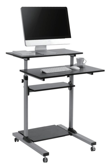
Height adjustable table top and keyboard tray and two utility shelves offer the basics